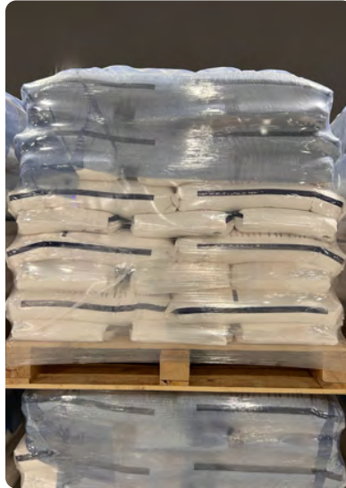
Palletised 25 kg small bags for container shipment