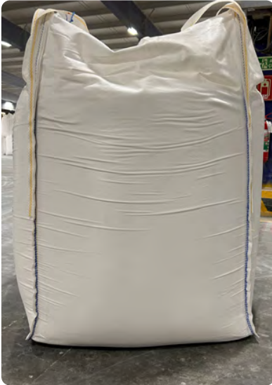
Container loaded with 1.25 tonne XL Big Bags

Almost 70% of the product soda ash is exported in bulk, also both products are exported in 25 kg small bags and 1.25 tonne big bags can be exported.