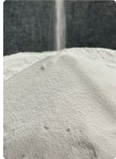
Products exported in bulk